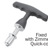
Fixed Driver with Zimmer Hall Quick-connect