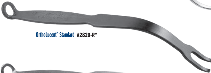
OrthoLucent™ Standard #2820-R*