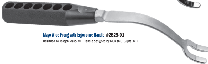
Mayo Wide Prong with Ergonomic Handle #2825-01