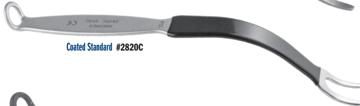
Coated Standard #2820C