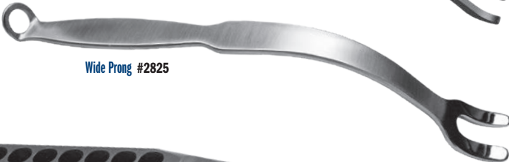
Wide Prong #2825