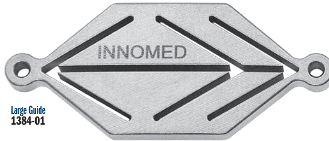
Large Guide 1384-01

Set includes one of each size Osteotomy Guide and three Olive Wires.