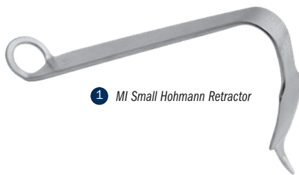
1 MI Small Hohmann Retractor