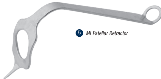
5 MI Patellar Retractor