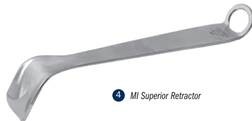
4 MI Superior Retractor