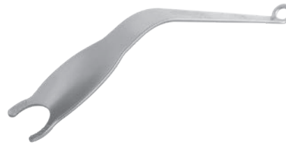
Narrow Proximal Femoral Elevator