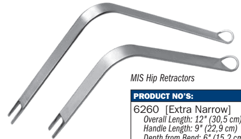
MIS Hip Retractors

Lighted retractor can be attached to a fiber optic light cable with ACMI (female) connector.