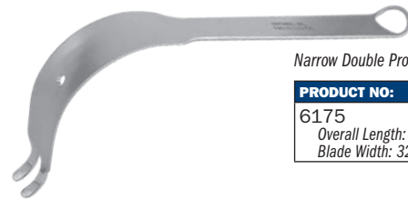
Narrow Double Prong Acetabular Retractor