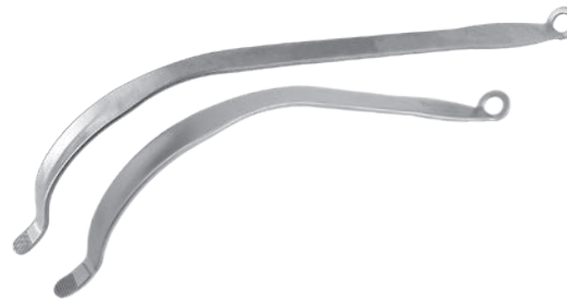
Narrow Cobra Retractors