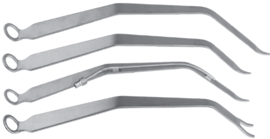
Single & Double Prong Double Bent Hohmann Acetabular Retractor - Long