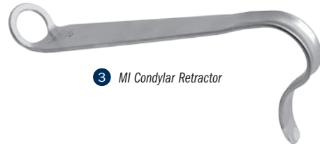
3 MI Condylar Retractor