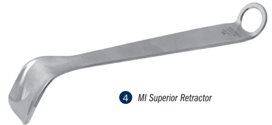
4 MI Superior Retractor