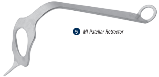
5 MI Patellar Retractor