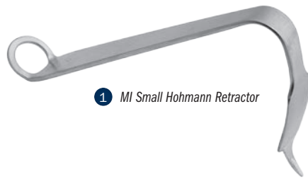
1 MI Small Hohmann Retractor