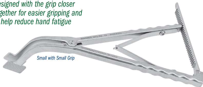
Small with Small Grip

Designed with the grip closer together for easier gripping and to help reduce hand fatigue