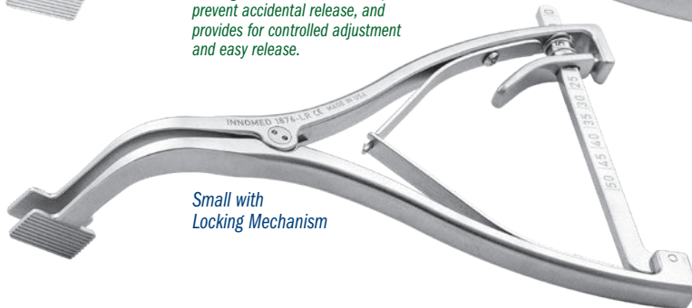
Small with Locking Mechanism

Locking ratchet mechanism helps prevent accidental release, and provides for controlled adjustment and easy release.