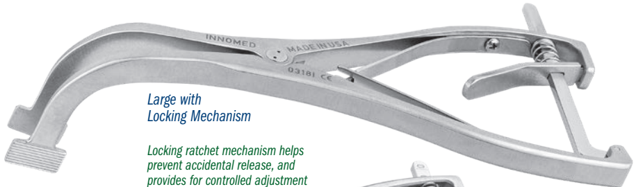
Large with Locking Mechanism

Locking ratchet mechanism helps prevent accidental release, and provides for controlled adjustment and easy release.