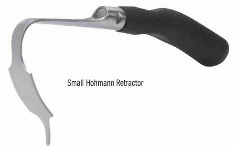
Small Hohmann Retractor

Silicone handles help reduce holding fatigue.