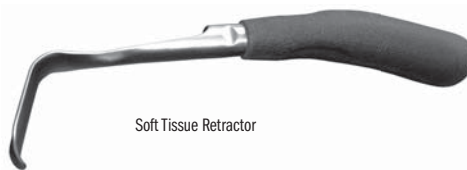
Soft Tissue Retractor