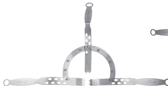
Delto Pectoral Approach