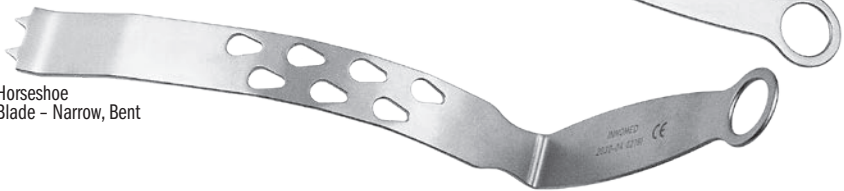
Horseshoe Blade - Narrow, Bent