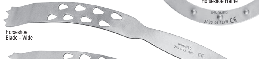
Horseshoe Blade - Wide