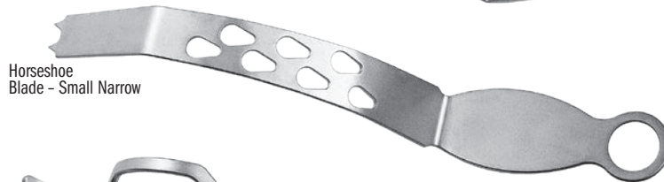
Horseshoe Blade - Small Narrow