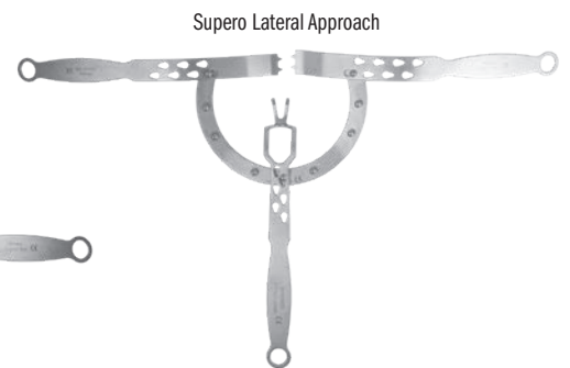
Supero Lateral Approach