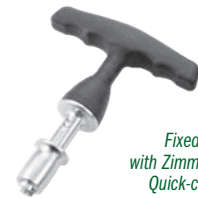
Fixed Driver with Zimmer Hall Quick-connect