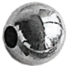
Interchangeable Head(s) Sold Separately

PRODUCT NO: 5031 Overall Length: 15.85" (40.2 cm) Platform End Diameter: 1" (2.54 cm)