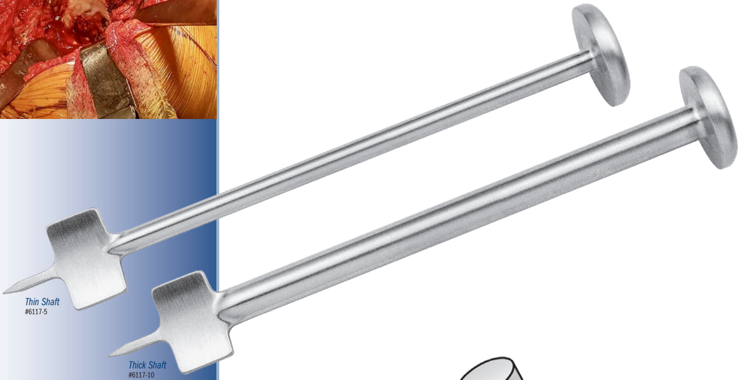
Thin Shaft #6117-5

A non-modular, fixed point retractor for pelvic visualization in THA and pelvic surgery, with the distal post and wing providing bony stability and retraction