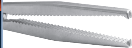
Tapered Narrow Jaw