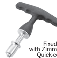
Fixed Driver with Zimmer Hall Quick-connect