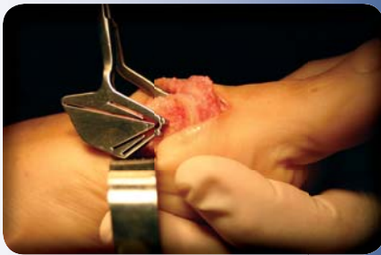
Osteotomy guide is affixed to the first metatarsal head

Following completion of the osteotomy, the clamp is removed, the metatarsal head transposed laterally and fixation achieved according to the surgeon's preference.