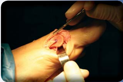
Completed chevron osteotomy