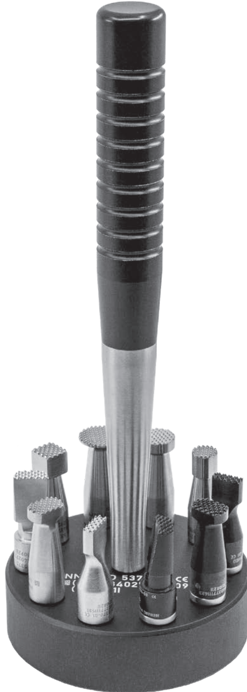
Stainless Steel Impactor Sizes