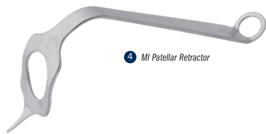
4 MI Patellar Retractor

Retractor handles are designed for optional use with modular weights to help hold the retractors in place.