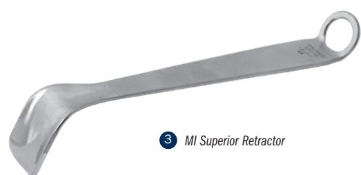
3 MI Superior Retractor