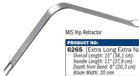
MIS Hip Retractor