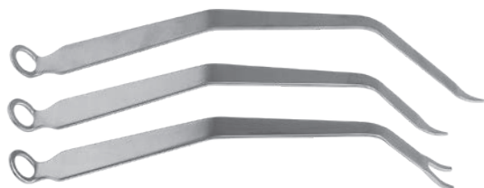
Single & Double Prong Double Bent Hohmann Acetabular Retractor - Long