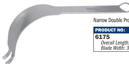
Narrow Double Prong Acetabular Retractor