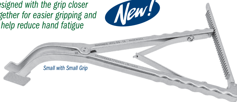
Small with Small Grip