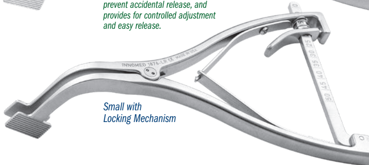
Small with Locking Mechanism

Locking ratchet mechanism helps prevent accidental release, and provides for controlled adjustment and easy release.