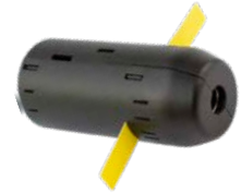
Disposable LED Light Source One included with each wand.