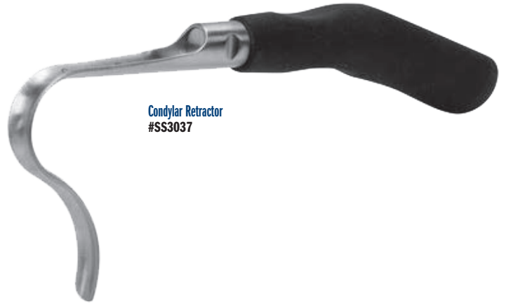
Condylar Retractor #SS3037