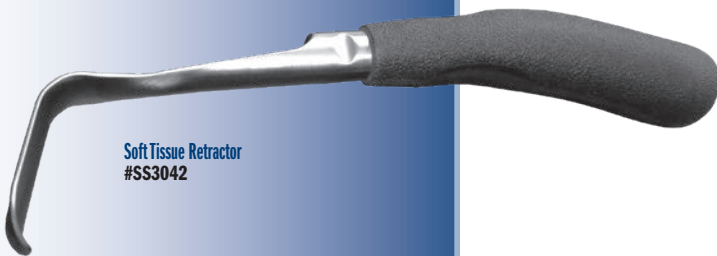
Soft Tissue Retractor #SS3042