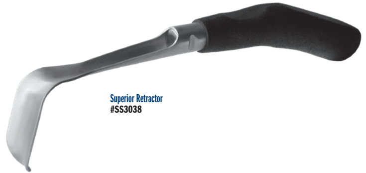
Superior Retractor #SS3038