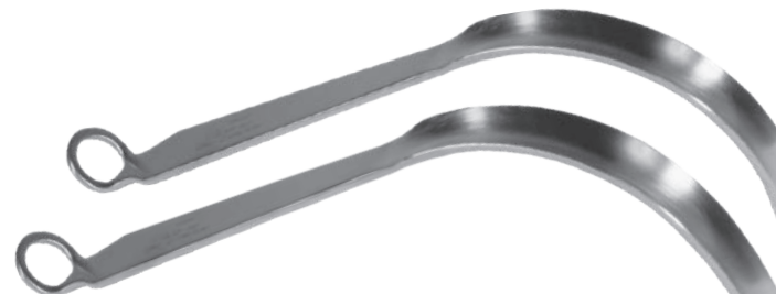
C Single Prong Soft Tissue Retractors