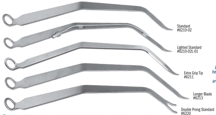
A Single & Double Prong Double Bent Hohmann Acetabular Retractor – Long

Extra Grip Tip helps to stabilize the retractor around the bone