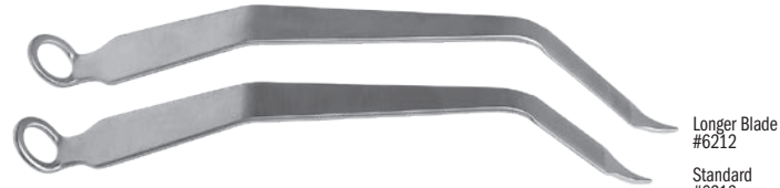
A Single Prong Double Bent Hohmann Acetabular Retractor

For general use in total, minimally invasive, and revision hip surgery