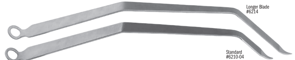
A Single Prong Double Bent Hohmann Acetabular Retractor – Extra Long

Extra Grip Tip helps to stabilize the retractor around the bone