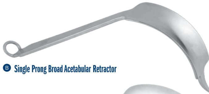
B Single Prong Broad Acetabular Retractor

For general use in total, minimally invasive, and revision hip surgery