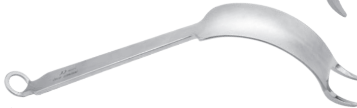
C Double Prong Broad Acetabular Retractor