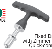
Fixed Driver with Zimmer Hall Quick-connect