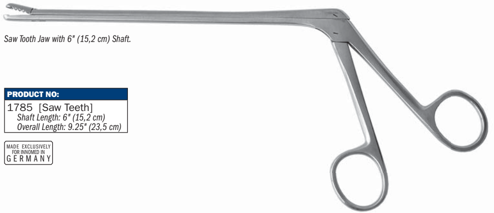
Saw Tooth Jaw with 6" (15,2 cm) Shaft.