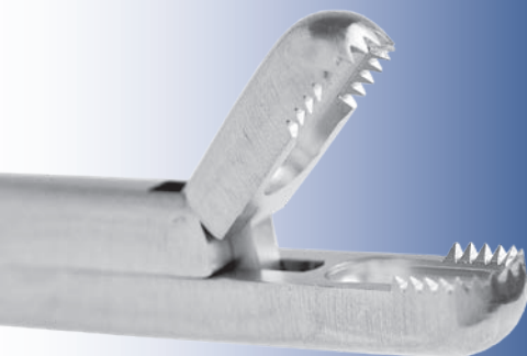
Shark Tooth Jaw