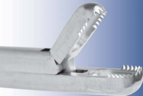
Shark Tooth Jaw