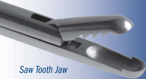
Saw Tooth Jaw