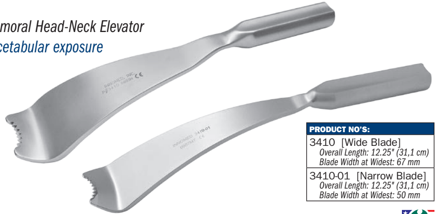
Amstutz Femoral Head-Neck Elevator Used for acetabular exposure