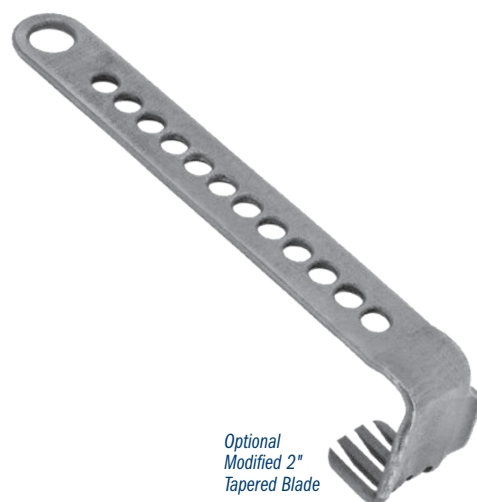
Optional Modified 2" Tapered Blade

Set includes locking frame (7425-01) and one each of the three blade sizes: 2" (7425-02), 3" (7425-03), and 4" (7425-04). (Optional Modified 2" Tapered Blade not included in set.)